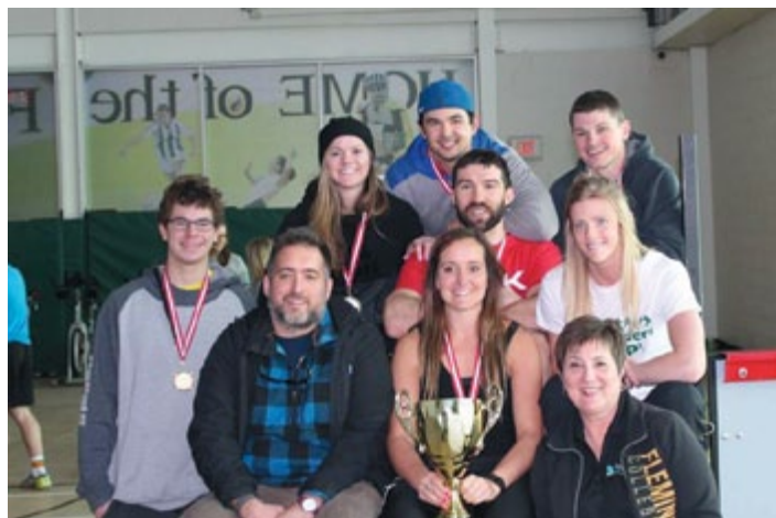
First Responders Cup winners