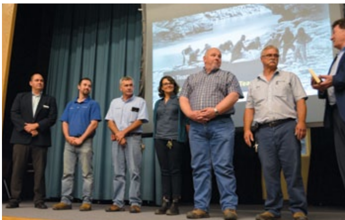
Physical Resources Team