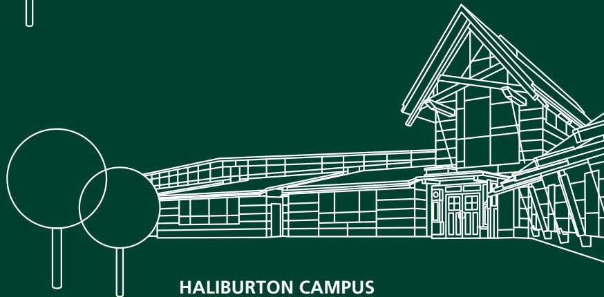
HALIBURTON CAMPUS Haliburton, ON