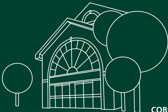
COBOURG CAMPUS Cobourg, ON