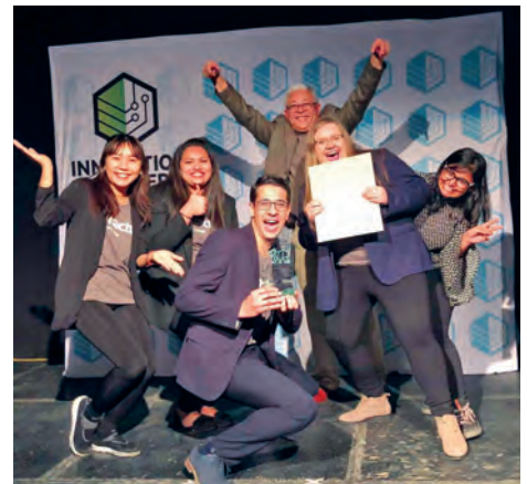
Enactus Fleming College is a multi-award winning team dedicated to creating a better world while pursuing entrepreneurial, leadership and social innovation goals.

Soon after this World Cup win, Enactus Fleming won Cubs' Lair – a pitch competition for young Peterborough entrepreneurs hosted by the Innovation Cluster and Peterborough & the Kawarthas Economic Development. The team earned a grand prize package worth more than $7,000 to jump-start their business journey.