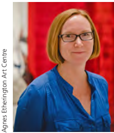
Agnes Etherington Art Centre