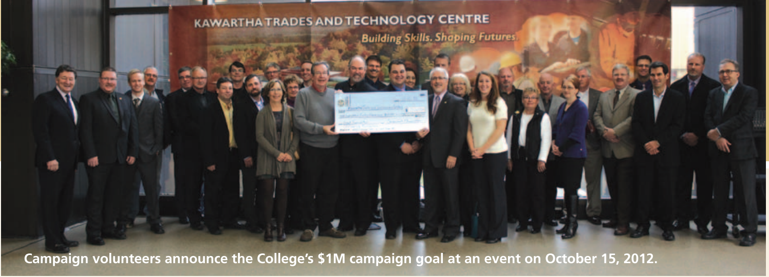
Campaign volunteers announce the College's $1M campaign goal at an event on October 15, 2012.