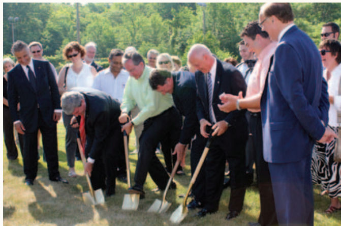
Groundbreaking ceremonies for the KTTC were held on July 16, 2012.

credits his Fleming experience with not only opening doors to employment but providing a solid technical foundation that has demonstrated first-hand the importance of an applied education.